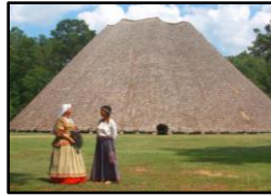
Mission San Luis